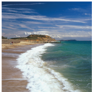
Previous page: Weymouth. Above: Hengistbury Head. On a clear day, the Isle of Wight appears as if it is a continuation of the mainland. Once man ore was mined here but it is now a nature reserve guarding the western side of Christchurch Harbour. Right: From the top of Hengistbury Head can be viewed this valuable piece of real estate in the form of a double row of children.