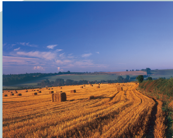
Above: Harvest time at Long Cridel.